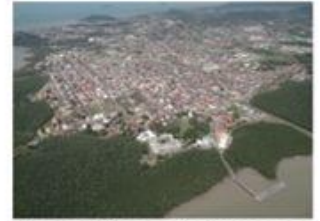
Vue aérienne de Cayenne

© We, Nanotec-Systems started our Cable Production in 2006, inspired with the Success of the Consumer Electronics Show Demonstration.