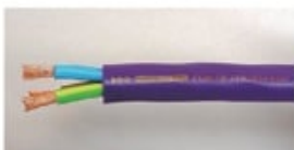
*POWER STRADA #307

● This Product was developed as 10th Anniversary of Nanotec-Systems