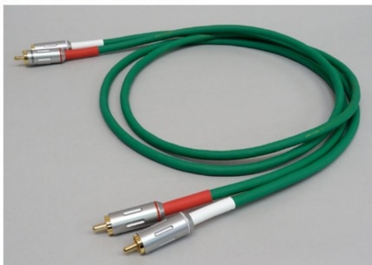
● #207/F2-RCA1.0 :

This Small but high quality RCA plugs made by FURUTECH are used very widely in the World. #207/F1-RCA1.0 [207F1R1.0] & #207/F1-RCA1.8 [207F1R1.8] are using Rhodium plated conductors & #207/F2-RCA1.0 [207F2R1.0] & #207/F2-RCA1.8 [207F2R1.8] are using Gold plated conductors. Rhodium plated conductors sounds very detailed & Gold plated conductors sounds mild but natural sound. For the XLR connectors, we selected Neutrik Gold plated type as a world standard sound.