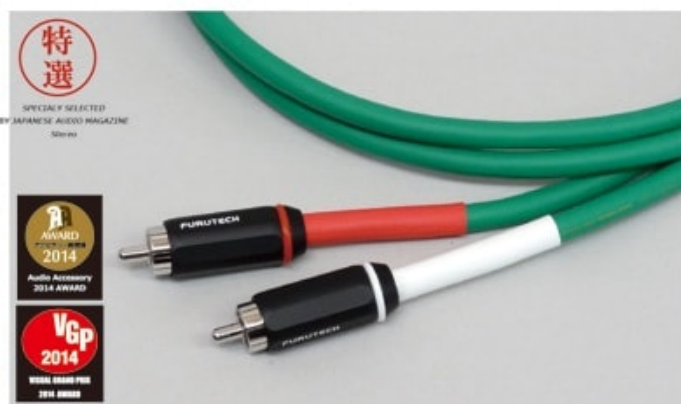
● #207/F1-RCA1.0 :

● The Exterior may be changed without prior notice.