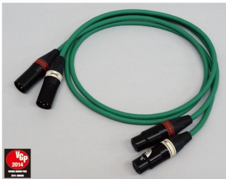
● #207/N1-XLR1.0 :